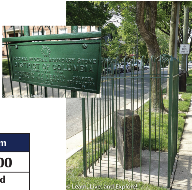
Boundary stone SW2 in DC neighborhood.